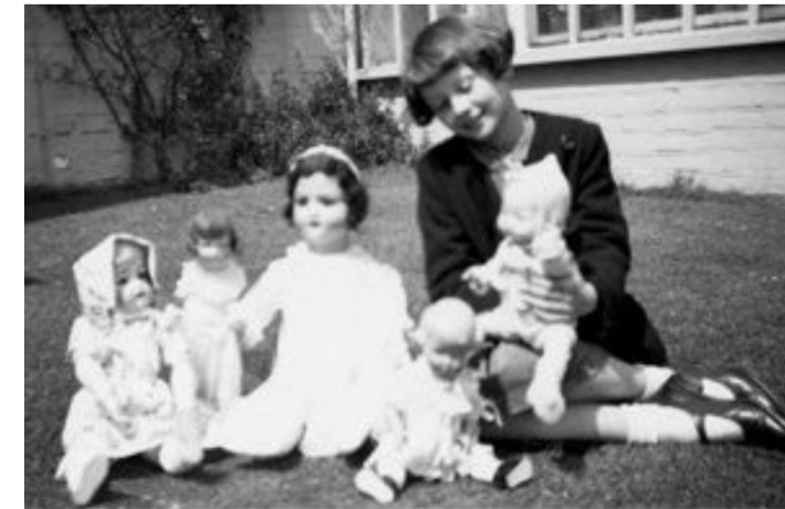
Audrey with her dolls in the garden of Orchard Villa

1. Folk memory can often reveal fascinating and unexpected stories. In the lovely East Kent village of Elham, one of the most delightful of these community stories tells of the little Dutch girl who spent the formative years of her childhood in the village. In the late 1930s when she lived in Elham her name was Audrey Ruston. Twenty years later she was known worldwide as Audrey Hepburn.