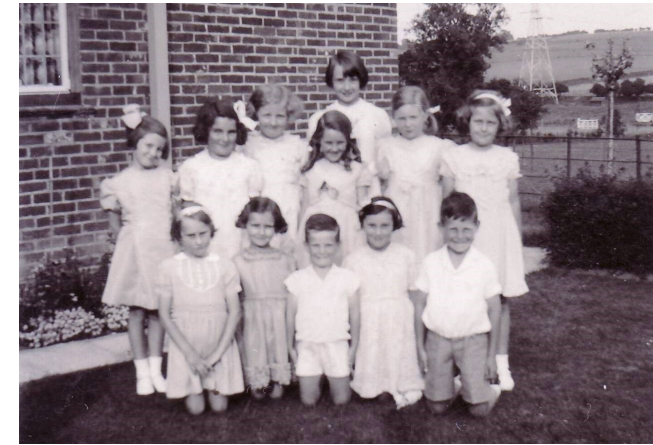
Audrey (back row centre) at a friend's 8th birthday party at Paddock Cottage, Ottinge in 1939. Sampson Family Collection

4. Perhaps too she felt that an English country village provided a safe and stable environment for her little girl. In interviews in later life, the film star Audrey Hepburn recalled how distressed the child Audrey Ruston was at the break-up of her parents' marriage: 'Other kids had a father but I didn't. I couldn't bear the idea that I wouldn't see him again. My mother had great love but she was not always able to show it...' Audrey was to see her father just four times between 1936 and 1939, and only met him again briefly much later in life. As is often the case, the child of estranged parents compensated by extravagant displays of affection, even to strangers: 'It always boils down to the same thing in my life - not only receiving love but desperately wanting to give it...'