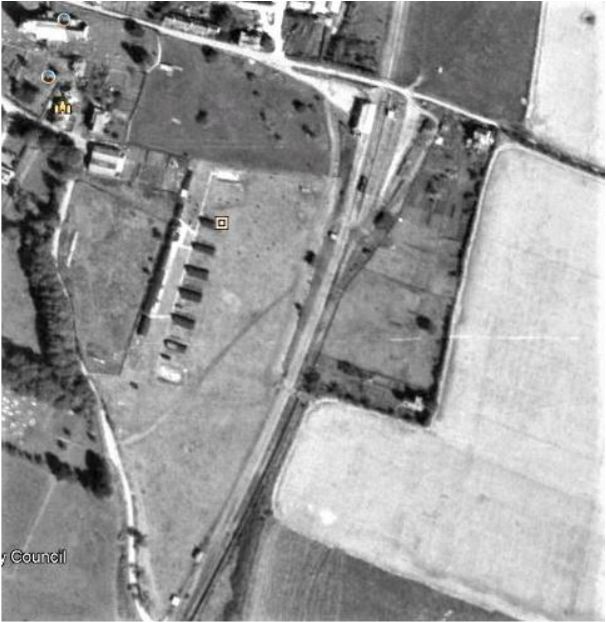
This image from the internet shows a similar group of Howitzer guns

This image from Google Earth, dated 1940, shows where the Nissen Huts were positioned on what is now Hog Green.