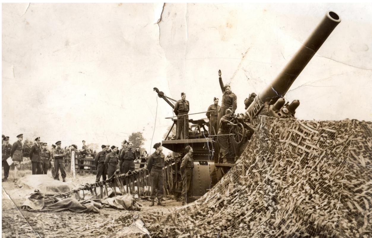
A railway mounted Howitzer – Could this be Elham?